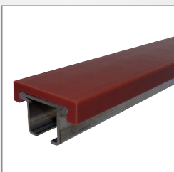
Chain Guide Profile Part S0367