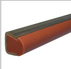
Product Side Guide Rail Part S0219