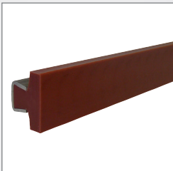
Product Side Guide Rail Part S0273