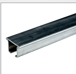
Chain Guide Profile Part S0368